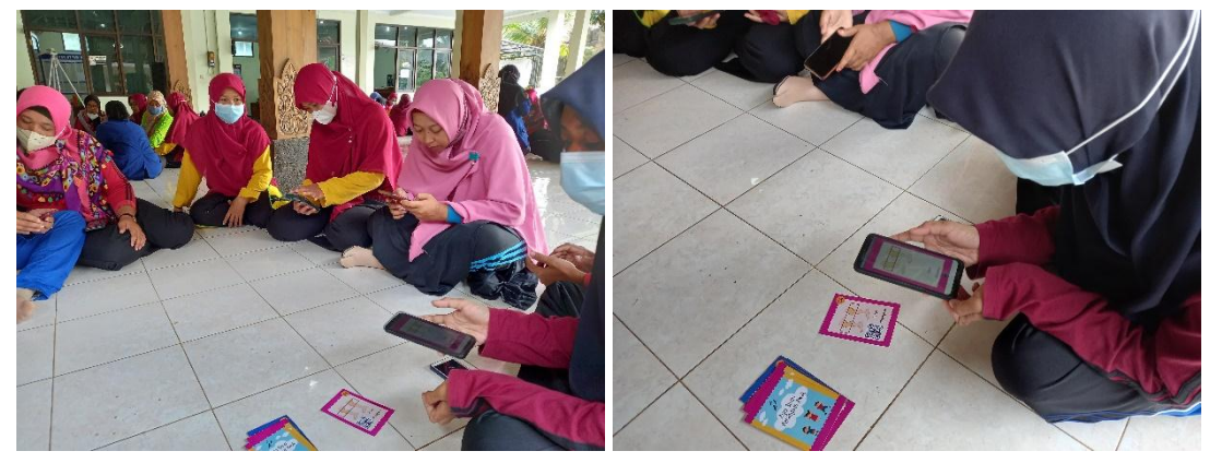
Figure 5. Implementation of the Use of Bilingual Picture Card Learning Media

Learning media was practiced by PAUD teachers, then a joint evaluation was performed in each group. Overall, the teachers were extremely interested and enthusiastic in applying this media. Apparently, this type of media has never been implemented by teachers. Moreover, the media is attractive and colorful, and is equipped with interesting pictures. This learning media also employs an application on the gadget which is applied to scan the QR code in which after scanning, a sound which is able to read the image descriptions occurs in both languages. With this sound, the teachers believed that the children in the classroom will be more interested in learning. However, this learning media also discovered some shortcomings based on the evaluations submitted by PAUD teachers; some of the teachers' gadgets which applications are difficult to install, card scanning must be sequential and cannot be randomized, hence, it produces less flexible, and scanning must be completed on every card that is used. can take a long time.