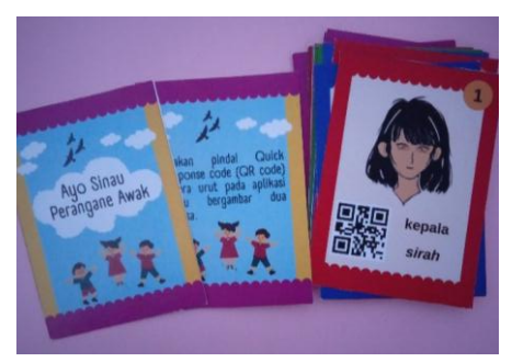
Figure 2. Bilingual Picture Card