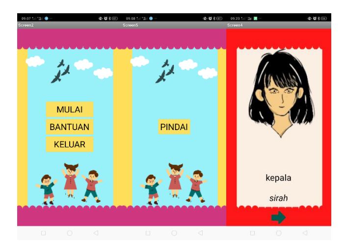
Figure 4. Pages on the Bilingual Picture Card Application

After the learning media was completed, the researchers then implemented the media for 45 PAUD teachers in Giripurwo Village, Purwosari, Gunung Kidul. In the application, a coaching clinic strategy was conducted, in which researchers provided training associated with the implementation of bilingual picture card learning media in groups. Then, the teachers were provided the opportunity to be able to practice the way to apply the media. During the application of this implementation practice, each teacher attempted to install the application and practice using the media.