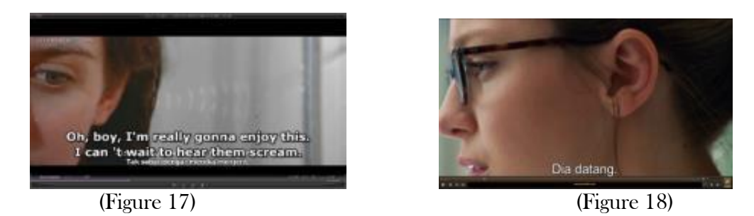
The last power that Supergirl is identical with is her super hearing. This power makes her able to hear sounds from far away, as long as she focuses on hearing the sounds or voices that she wants to hear. Those iconic elements appeared during the film and almost in all episodes in her series in 2015.

The other pictures above show how she uses her Supervision power. She can see the objects behind the wall because of her Supervision power. It helps her in some conditions.