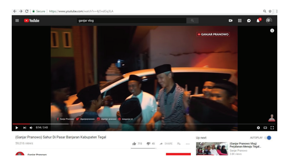
Figure 1. Vlog "(Ganjar Pranowo) Sahur di Pasar Banjaran Kabupaten Tegal" (https://www.youtube.com/watch?v=4jOvsIGq3LA&t=147s)