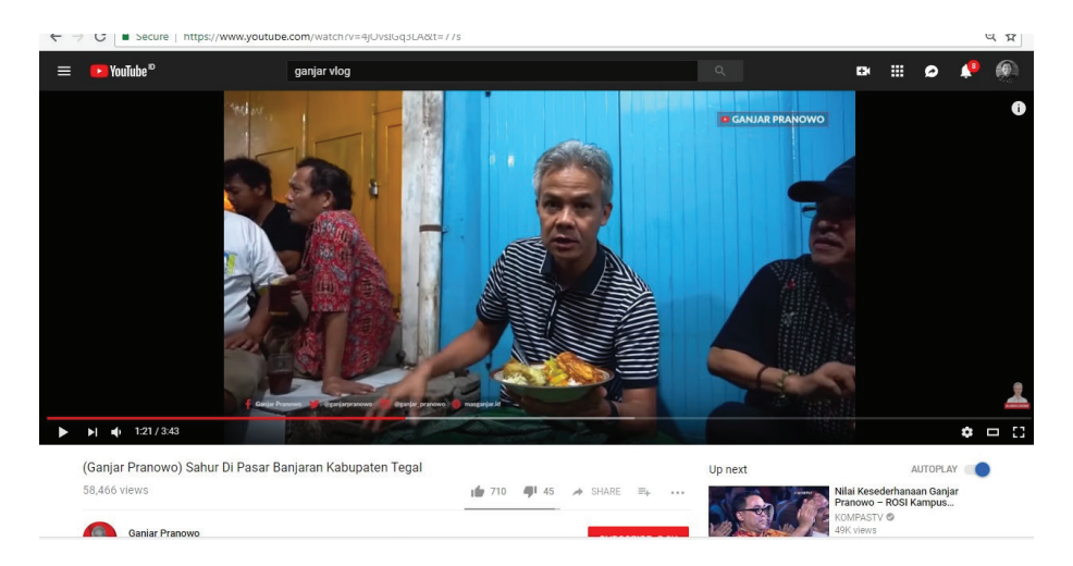
Figure 2. Vlog "(Ganjar Pranowo Vlog) Sahur di Pasar Banjaran Kabupaten Tegal" (https://www.youtube.com/ watch?v=4jOvsIGq3LA&t=147s)