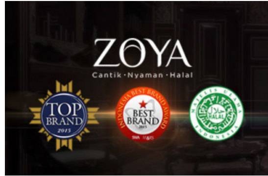
Picture 1. Slogan dan Halal Label in Zoya's Hijab

gains trust from their consumers due to their products' attractive designs and colours, and they also have effective marketing methods (Liputan6, 2016).