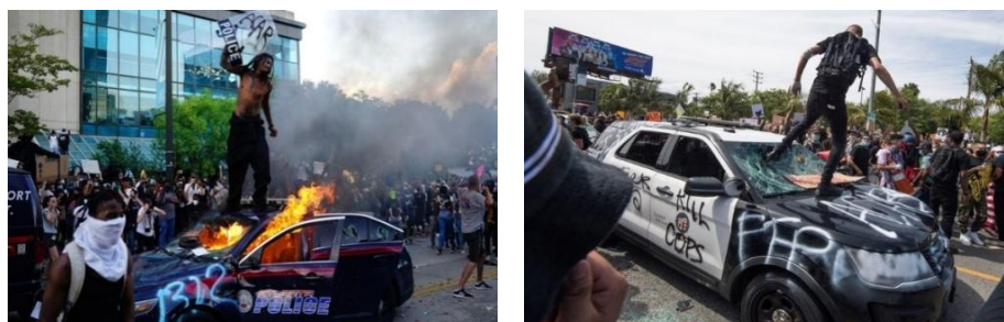
Figure 5 (left) and Figure 6 (right): The rage of demonstrators reaches its climax and they release it by destroying, scratching, and burning police cars.

and angry over policemen's brutalities. The policemen have frequently shown racism and discriminative actions toward black people. It leads to the rage of the demonstrators which results in the destruction of the police cars. There are at least two common slogans appearing in both pictures, i.e.: ACAB and 1312. ACAB is the abbreviation of All Cops Are Bastards whereas 1312 is the code of ACAB in numeric form (1: A, 3 : C, 2 : B). 'Bastard' is a swear word for showing anger. In the case, it sounded the demonstrators' expression on the policemen's unethical and extremely dirty deed by pressing a minority group.