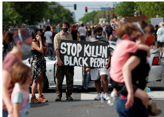
Figure 4: The demonstrators gather on the spot where unarmed George Floyd was killed by a police officer. Two demonstrators are standing in the middle of the road with their hands holding a board written 'Stop Killin' Black People' (Minneapolis, May 26, 2020).

Symbol : The cause of chaos is not the black people but the discrimination applied to them.