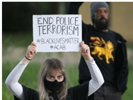
Figure 8: A demonstrant is holding a board with End Police Terrorism #BlackLives Matter #ACAB text written on it (Fish Creek Park, May 31, 2020)

In Figure 8, a woman with a serious face is seen lifting a board with End Police Terrorism #BlackLivesMatter #ACAB text written on it. Again, Black Lives Matter and ACAB codes appear here. These two codes were always seen at any session of the demonstrations. Imperative sentence End Police Terrorism was such a heavy punch to the policemen as by the text they had been labeled as part of terrorism. There were a lot of calls addressed to the policemen, such as bastards, killers, racists, and terrorists. The text illustrates social and psychological condition of the demonstrators at the moment. The expression likely emerged from the demonstrators' minds who had been very annoyed with the policemen whose behaviours and deeds did not reflect their own characters at all. Their actions looked inhuman and showed no ethics. It symbolizes that most of American people did not respect to or even obey the police. People all over the world hate racism behaviour. Nearly all countries in this world have sounded their voices on equivalence, including the United States. Strangely, it is in America where racial behaviours are just growing high. Here, the suspects of racism were frequently out of punishment and government's policies tended to marginalize the minority groups as well. Therefore, the actors of racism were popularly nicknamed 'terrorists with governmental protection'.