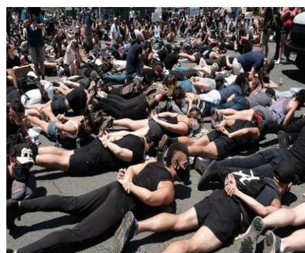
Figure 1 (left) and Figure 2 (right): Demonstrants are laying in prone positions with their hands tied behind their body in 8 minutes and 46 seconds to imitate George Floyd's position when a police officer was pressing his knee on Floyd's neck (Los Angeles, June 10, 2020).

The purpose of people to play role the last scene of George Floyd's life was to tell the world how tragic his condition was and to defend the right of black people. Even though, Floyd had told the police officer that he could not breath easily, his neck was kept being pressed with both hands tied behind