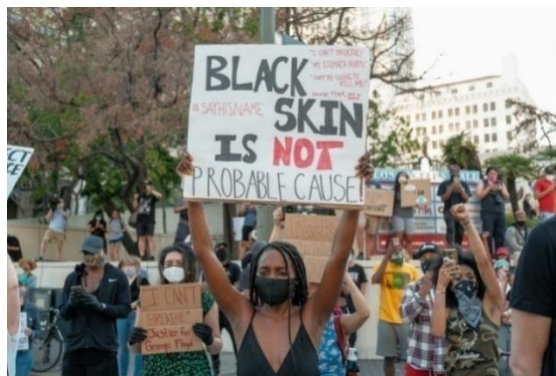
Figure 3: A black-skinned woman is lifting a board with 'Black Skin is Not Probable Cause!' text written on it (Los Angeles, May 27, 2020).

Most of the texts appeared in George Floyd's death demonstrations had black skin themes, like Black Lives Matter , the slogan commonly used for defending black people rights. The form language used was monolingual, that was English. In the photograph, it is told that black people were not the cause of the chaos. It was the unscrupulous white-skinned police officers who had made the lives of black people threatened. It was not just an apology from black people side. In the photograph, the black skinned woman is surrounded by white-skinned people who have the same purposes to stand for the human rights of the members of black community.