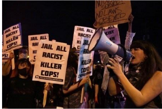
Figure 7: A lot of demonstrators gather in front of a police office. A woman is holding a megaphone and shouting through it. Next to her, other demonstrators are holding a board written 'Jail All Racist Killer Cops!' (Minneapolis, May 29, 2020).

In Figure 8, a woman with a serious face is seen lifting a board with End Police Terrorism #BlackLivesMatter #ACAB text written on it. Again, Black Lives Matter and ACAB codes appear here. These two codes were always seen at any session of the demonstrations. Imperative sentence End Police Terrorism was such a heavy punch to the policemen as by the text they had been labeled as part of terrorism. There were a lot of calls addressed to the policemen, such as bastards, killers, racists, and terrorists. The text illustrates social and psychological condition of the demonstrators at the moment. The expression likely emerged from the demonstrators' minds who had been very annoyed with the policemen whose behaviours and deeds did not reflect their own characters at all. Their actions looked inhuman and showed no ethics. It symbolizes that most of American people did not respect to or even obey the police. People all over the world hate racism behaviour. Nearly all countries in this world have sounded their voices on equivalence, including the United States. Strangely, it is in America where racial behaviours are just growing high. Here, the suspects of racism were frequently out of punishment and government's policies tended to marginalize the minority groups as well. Therefore, the actors of racism were popularly nicknamed 'terrorists with governmental protection'.